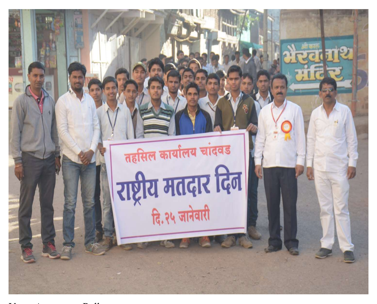
Voter Awareness Rally.