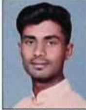
Mr. Matoshree Swyam Rajgar Seva Sah Sanatha Ltd., Nashik