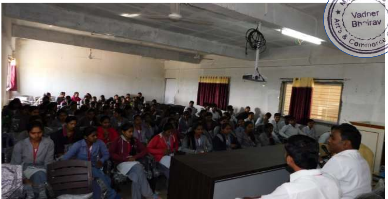
On this program students were present