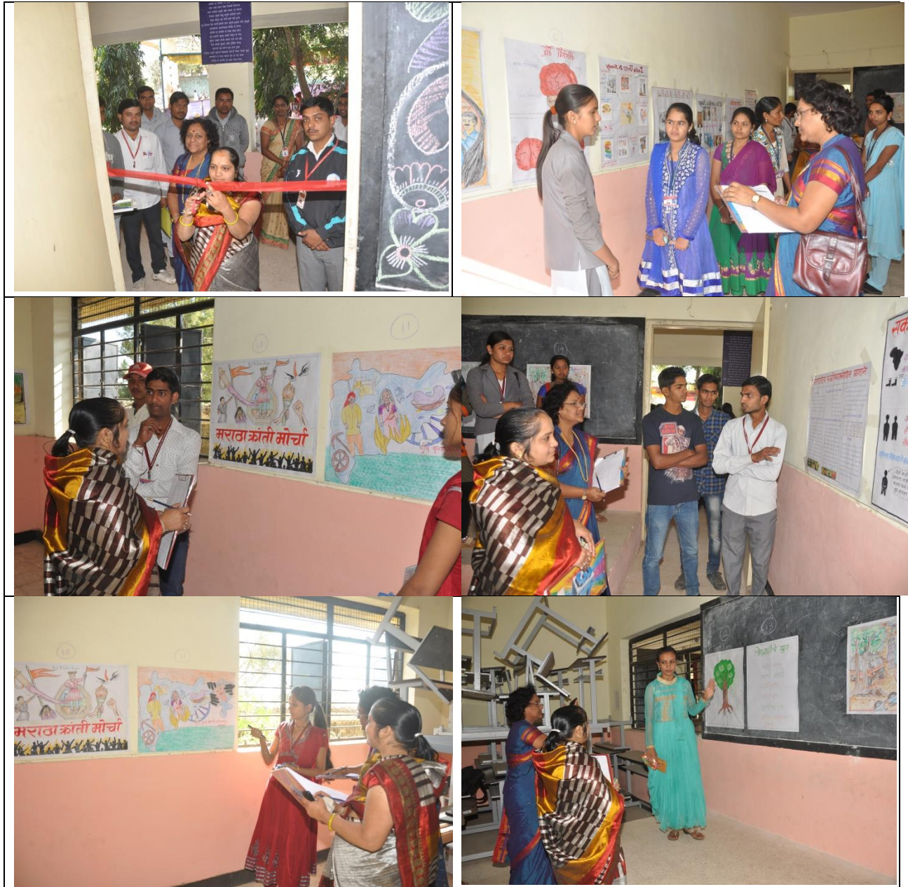
A few moments from Poster Presentation