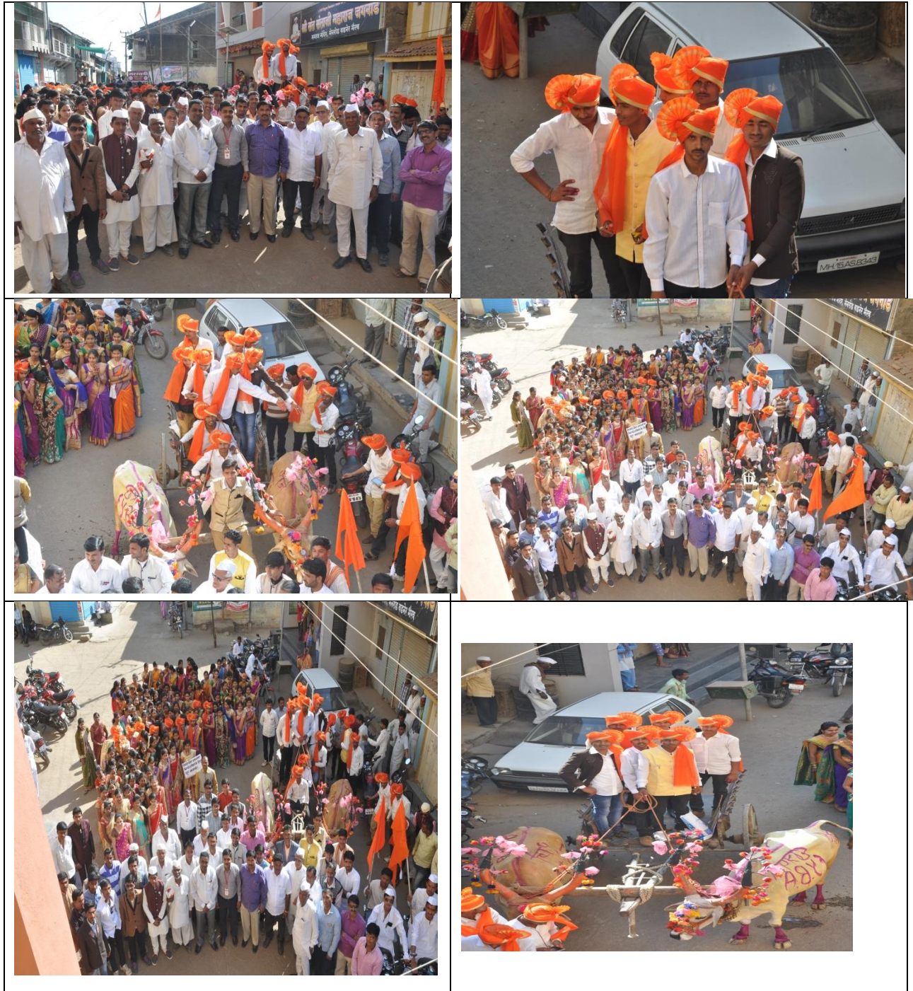
A few moments from the Social Awareness rally at Vadner Bhairav