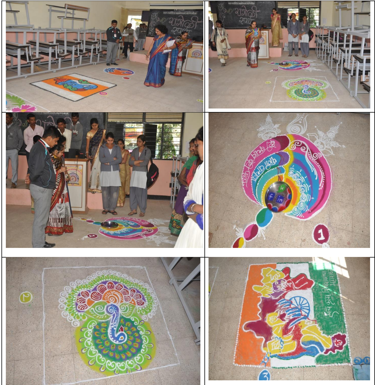
A few moments from the Rangoli Competition