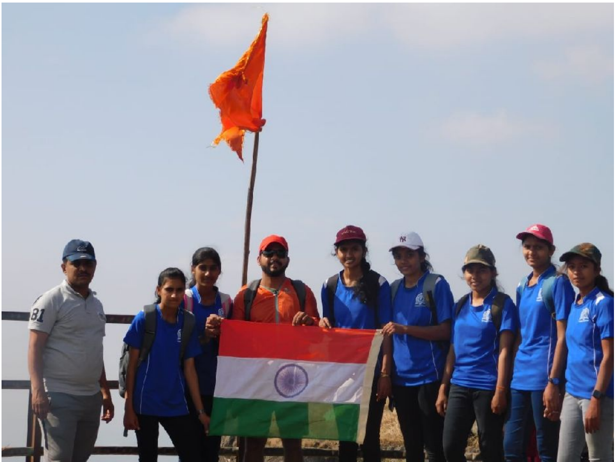
Our Staff and student with national flag @ Dhodap fort