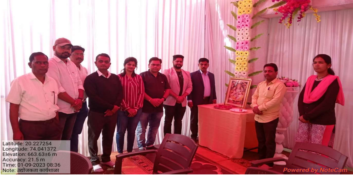
Sarswati Mata Pujan by Guest