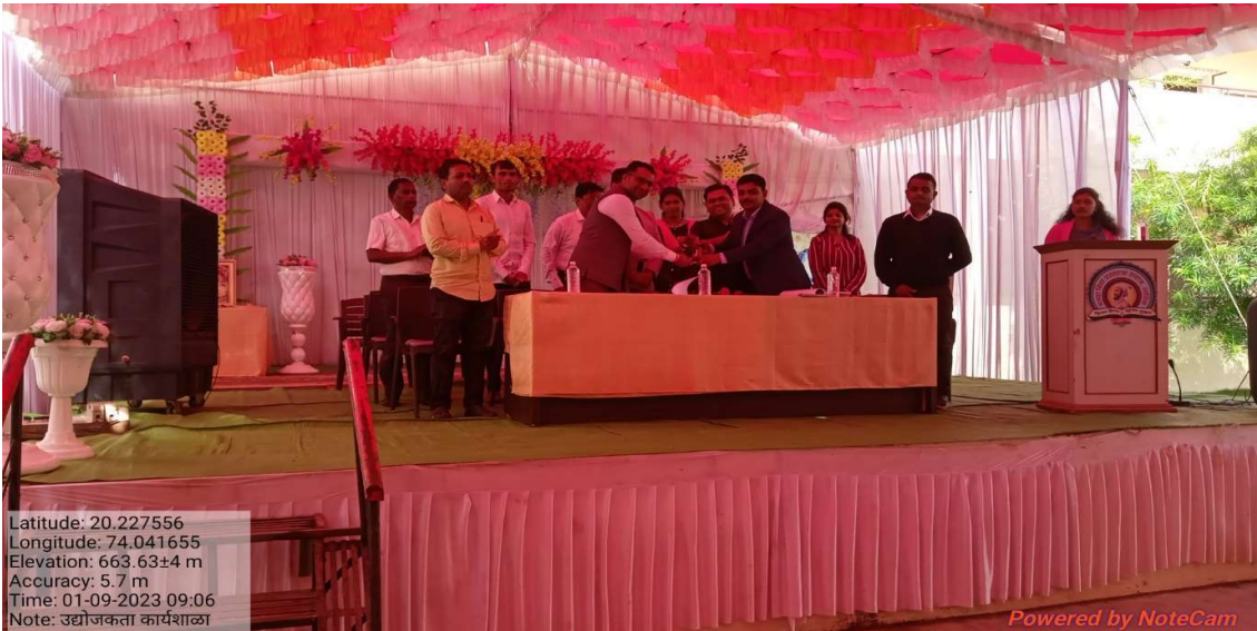
Greeting to Guest