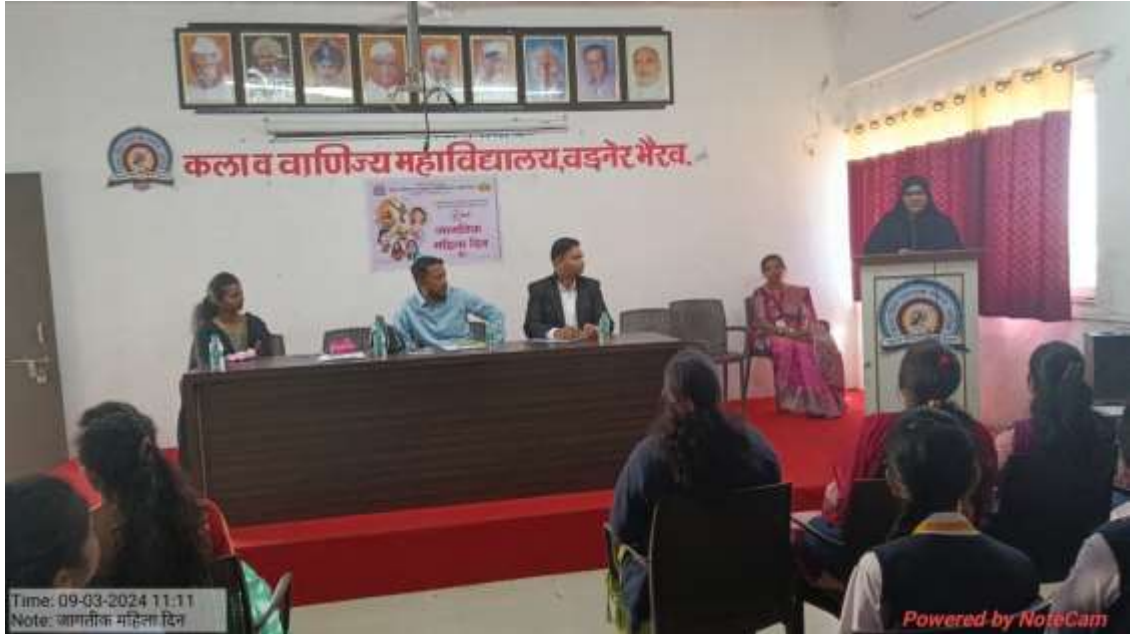
Guest addressing students on occasion of women's day.